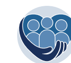
Caring for our Team

Owensboro Health Foundation seeks to align funding priorities with the Core Commitments and Strategic Imperatives of Owensboro Health while also addressing the key health needs that impact the communities we serve. At Owensboro Health Foundation, we take great pride in the joy of...