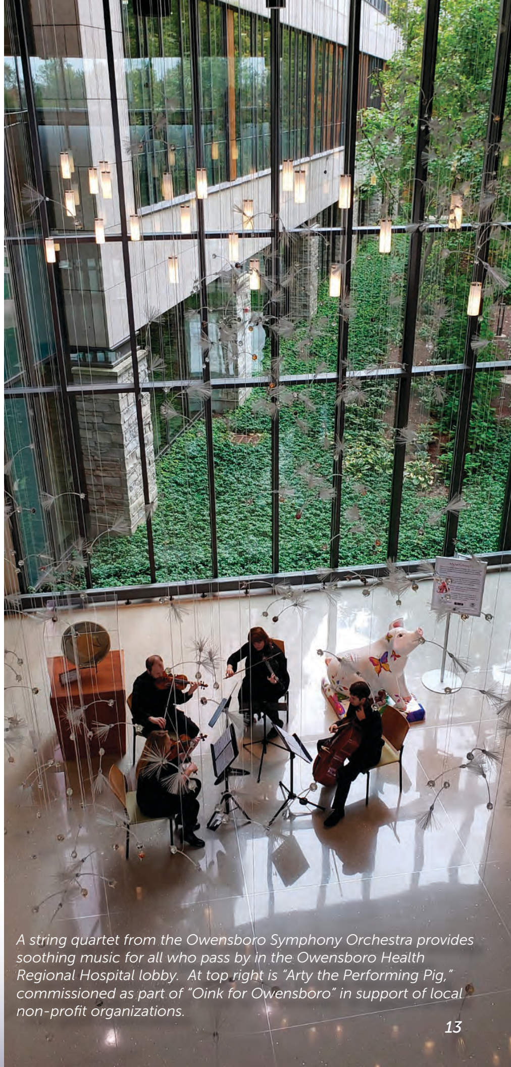
A string quartet from the Owensboro Symphony Orchestra provides soothing music for all who pass by in the Owensboro Health Regional Hospital lobby. At top right is "Arty the Performing Pig," commissioned as part of "Oink for Owensboro" in support of local non-profit organizations.