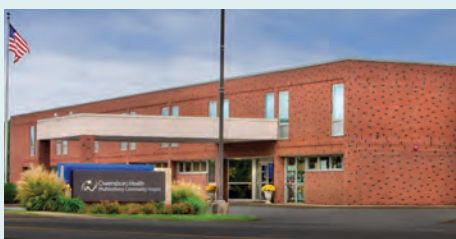
Owensboro Health Muhlenberg Community Hospital 440 Hopkinsville Street Greenville, KY 42345