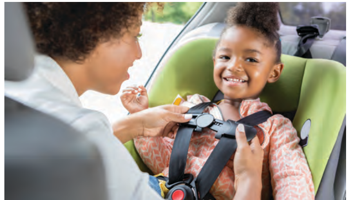
Car Seat Assistance Program