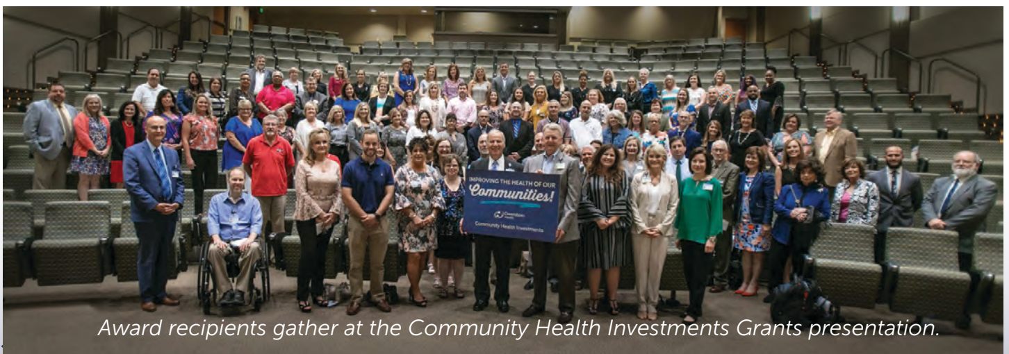
Award recipients gather at the Community Health Investments Grants presentation.

In 2018, Owensboro Health funded a $25,000 grant to the Green River District Health Department to help fund nicotine replacement therapy for individuals who want to quit tobacco.