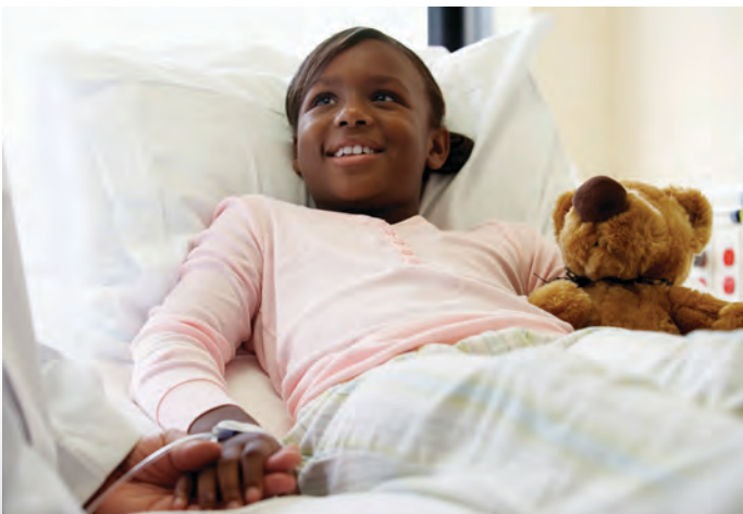
Care Bears for Kids