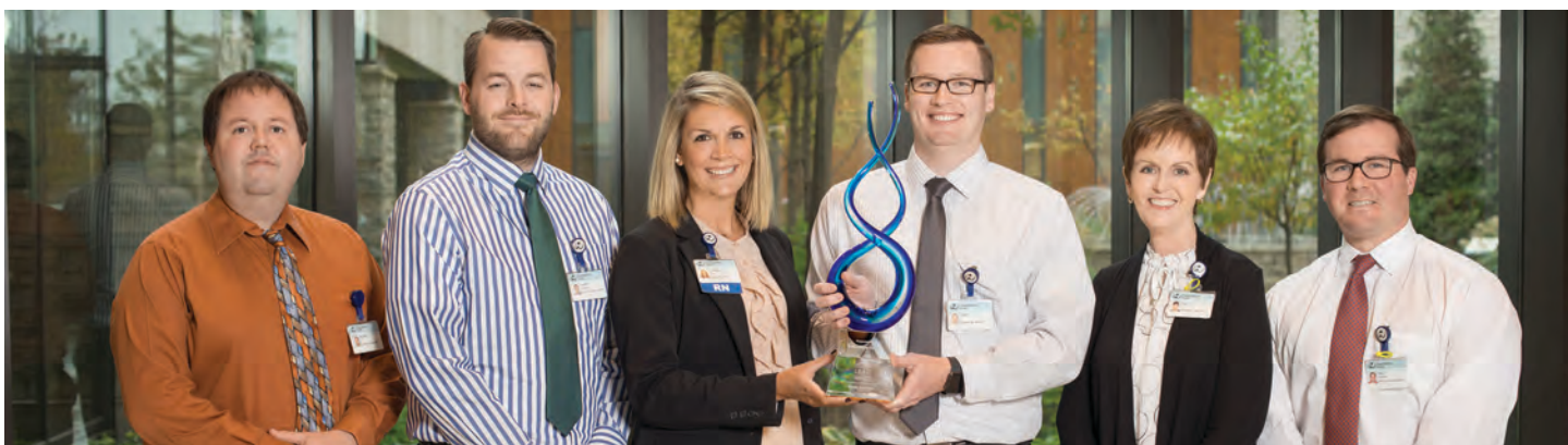
Owensboro Health Decision Support Team received the Strata Decision LEAP award in November 2019.