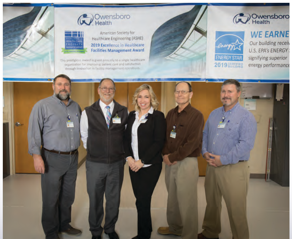
(Right) OHRH facilities team celebrates its national award.

This intentional approach to energy efficiency, led