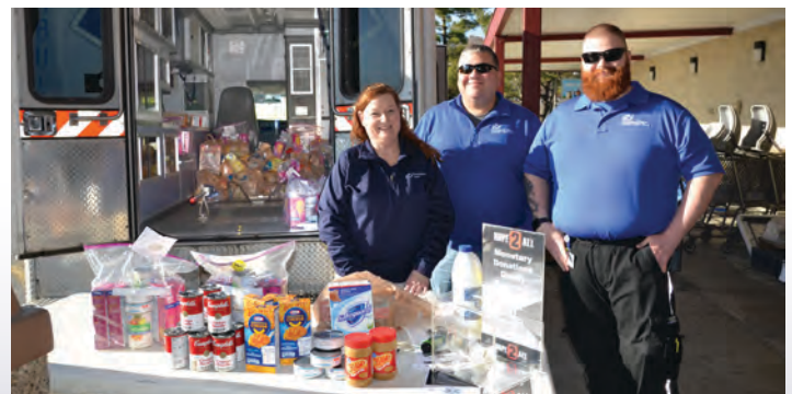
Community Grants in Muhlenberg County