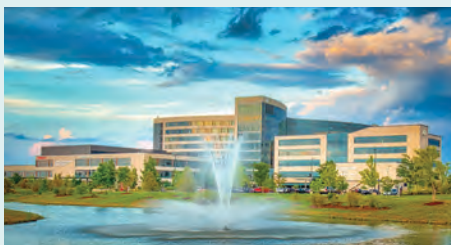
Owensboro Health Regional Hospital 1201 Pleasant Valley Road Owensboro, KY 42303