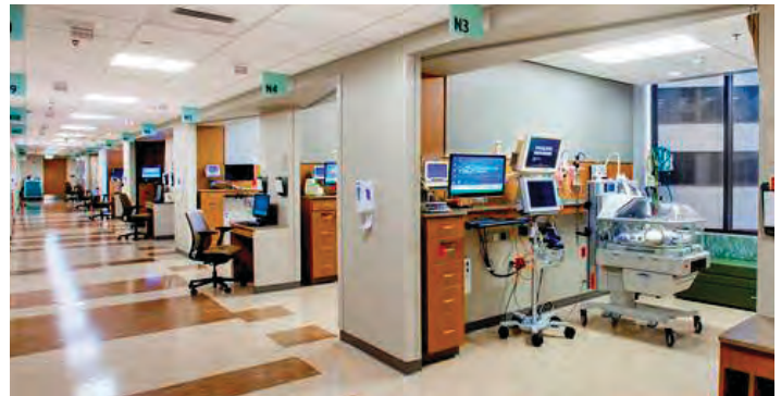
NICU at Owensboro Health Regional Hospital