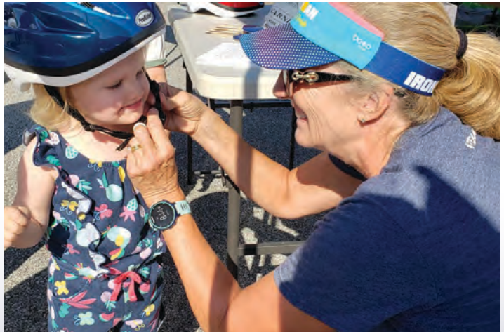
Bike Helmets and Trauma Prevention