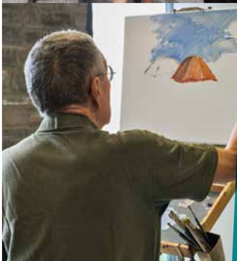
Arts in Healing - Signature Series