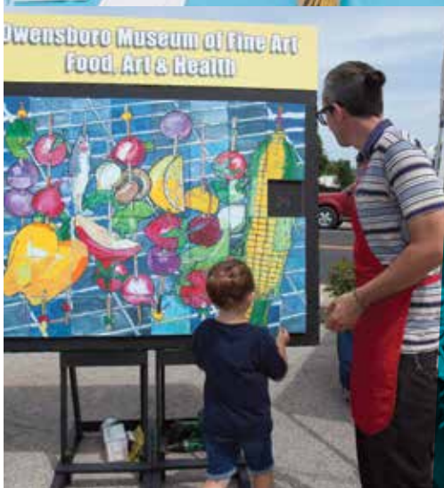
Food + Art + Health