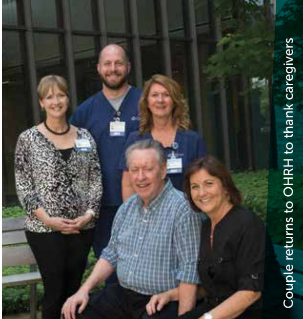
Couple returns to OHRH to thank caregivers