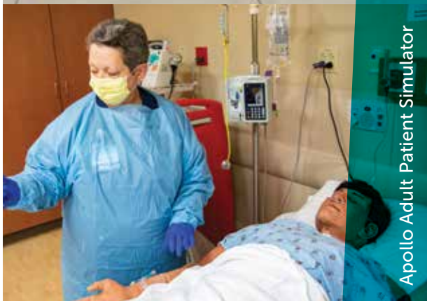
Apollo Adult Patient Simulator