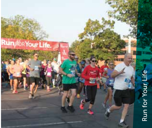
Run for Your Life