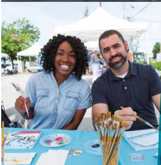
Food + Art + Health