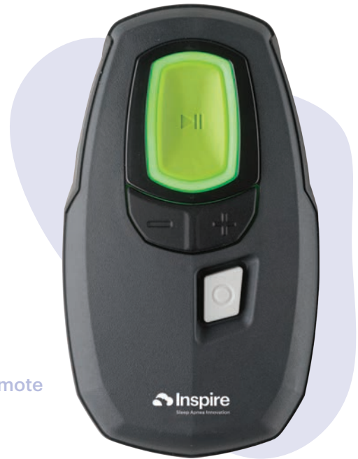
Inspire Sleep Remote

Inspire works inside your body while you sleep. It's a small device placed during a same-day, outpatient procedure. When you're ready for bed, simply click the remote to turn Inspire on. While you sleep, Inspire opens your airway, allowing you to breathe normally and sleep peacefully.